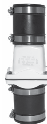
30-0021 Pvc Plastic

Consult Factory or local representative for state approvals