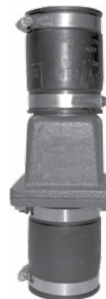
30-0151 Cast Iron